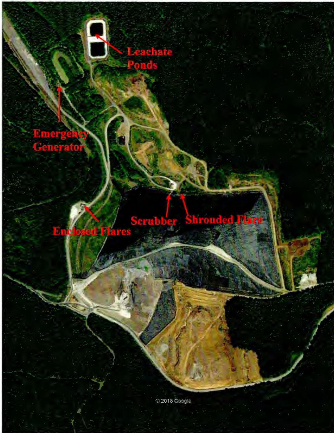
Google Earth – June 21, 2017 Image