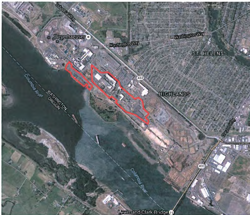
NORPAC (Longview, Washington)

NORPAC is part of a larger 700+ acre site that includes a kraft pulp and paper mill, wastewater treatment plant, log export yard, and dimensional lumber plant. These separate sources have historically been considered as a single major source for Title V permitting due to common ownership and control. On November 1, 2016 NORPAC was sold to One Rock Capital Partners, LLC and is no longer under the same ownership or control as other facilities at the site. The Department of Ecology has issued a disaggregation memo to document the status of NORPAC as a separate stationary source for the purposes of the AOP Program.